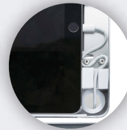
Cable Management System