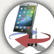
Rotates 360 Degrees