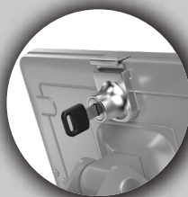
Lock & Key Security System