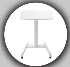
Compact and Mobile