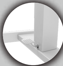
Height Adjustable with Pedal

CTA's Mobile Workstation adjusts to seated positions or standing positions, making it an ideal solution to create an office environment anywhere - at work, home, a clinic, pop-up shop, or even a tradeshow booth. This sturdy metal workstation moves smoothly on 4 rolling casters and has 2 casters that lock in place with a simple toggle foot switch. The features that makes this desk specifically unique are two predrilled holes in each top corner, allowing for the attachment of 2 grommet mounts. Choose any two compatible mounts to build your personally designed work station to cater to your exact needs! If you choose to not use the mounting holes, no worries... The holes are able to be filled with the provided plugs to make a smooth tablet top. An easy-to-operate gas spring foot pedal at the base of the center post lets users adjust the height of the workstation from 30 to 44-inches high, allowing a quick switch between seated and standing positions. The generous 23.5 x 20-inch work surface leaves plenty of space for any monitor, laptop, desktop, or tablet desk kiosk up to 17.6 lbs.