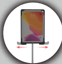
Easy Sliding Mechanism for Tablet Holder

Create a stable and easily adjustable secure tablet workstation for your home, office, or classroom. This easy-setup floor stand is without equal in adjustability, featuring a powerful, flexible gooseneck and a tilting headpiece with easy 360-degree rotation. Customize your workstation further, with the stand's height-adjusting, telescoping pole. The extra protective full enclosure not only secures with a key-lock but also protects your whole iPad, leaving ports, buttons and camera fully accessible. A tethered coiled cord attached to the lock, makes it easy and convenient to lock and unlock the enclosure without the risk of misplacing the lock.