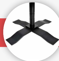
Stable Cross Base