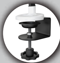
Heavy Duty Sturdy Clamp Base