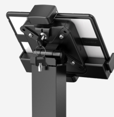
ANTI-THEFT SECURITY HOLDER