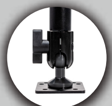
Ball Socket Joints