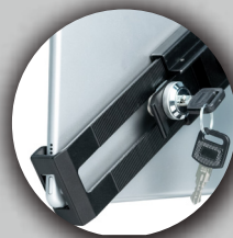
Lock + Key