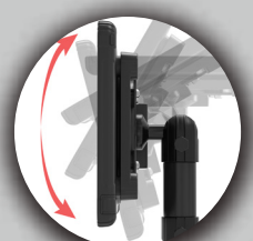
Ball Socket Adjustability