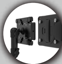
Inductive Charging Smart Technology