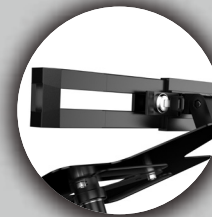
Anti-Theft Lock & Key Holder