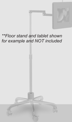
**Floor stand and tablet shown for example and NOT included