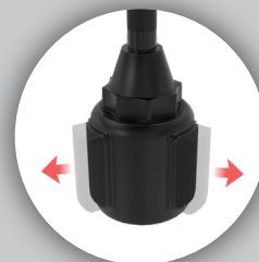
Gripping Arms at Base