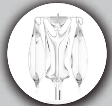
Sturdy and Capable of Carrying Multiple Transfusion Bags