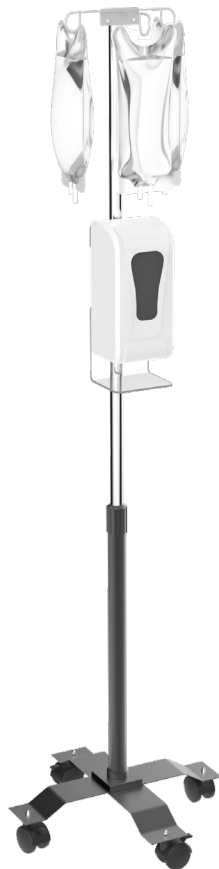
**Floor Stand, Hand Sanitizer and Accessories not included