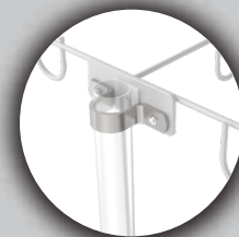
Simple & Fast Attachment