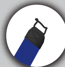
Sturdy End Clips for a Secure Hold