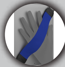
Ultra Flexible Elastic Nylon Material