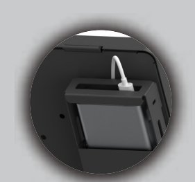
Port Accessibility for Buttons and Cables