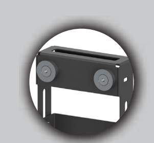
Flexible to Use Magnet Feature