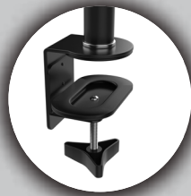
Sturdy Clamp Connection