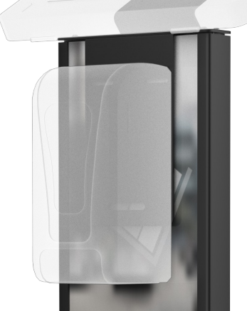
*Floor Stand and Components Not Included and for Example Purposes