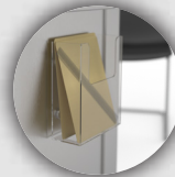
Perfect for Metallic Surfaces