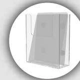
Durable Transparent Plastic