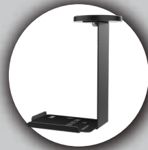
Thin & Compact