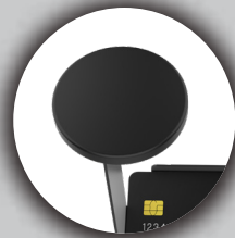
Strong Magnet Connection