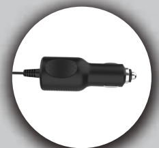
Fits Vehicle Power Outlet