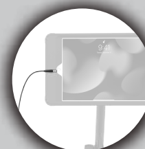
Inductive Charging Compatible