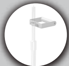
Compact and Portable