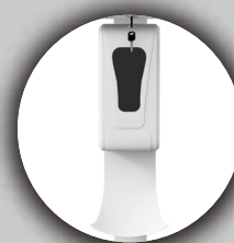
Compatible with CTA Dispensers