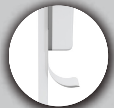
Fast & Simple Installation