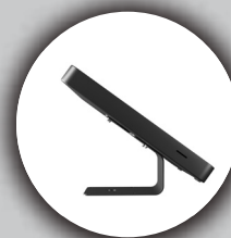
Sleek Design for Comfortable Use