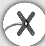
VESA compatible 75mm x 75mm & 100mm x 100mm