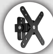
VESA 75x75 or 100x100 Compatibility