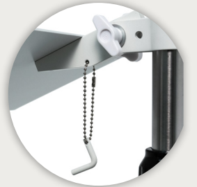
Angle Adjustment Lock