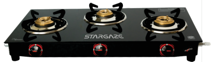
GALAXY 3 BURNER