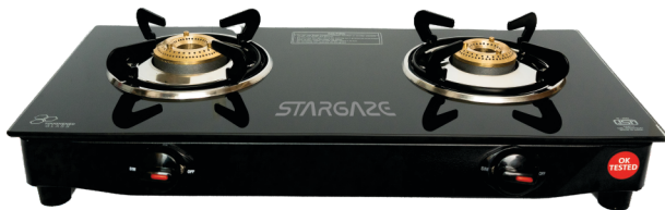
GALAXY 2 BURNER