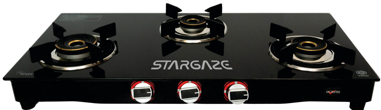
CRISTA 3 BURNER