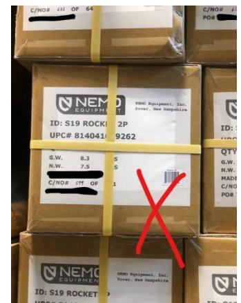
3 Prohibited banding