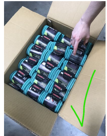
1 Efficiently packed carton