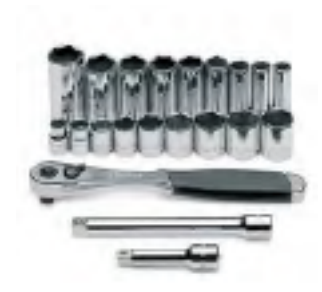
Socket Wrench Set

7/16 inch socket or combination wrench 1/2 inch socket or combination wrench Allen wrench (provided in Parts Bag)