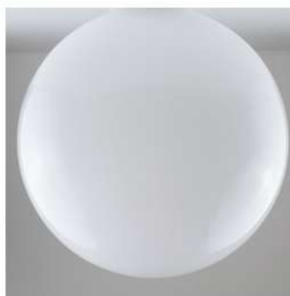
SHG350NN 350Max Dia No Gallery Neck 85Hole 2 piece screw gallery VASE92 Or plain vase cap VASE100