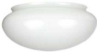
SHB250 Ceiling Bowl 115H 225Max Dia 205Gallery Ceiling galleries available