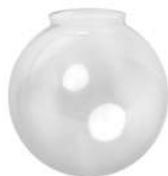
SHGC200 200H 200Dia 111Gallery (4¼")