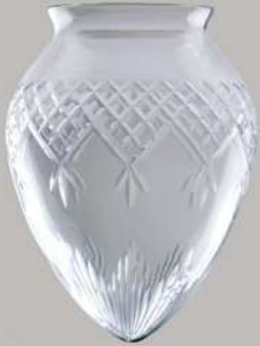
SHPC2 Small clearcut pineapple acorn 165H 123Dia 85Gallery (3¼")