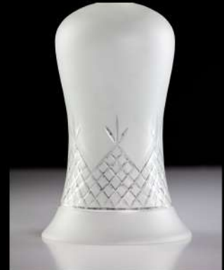
SHPST2 Etched pineapple storm shade 137Dia - Top 215H 110Dia - Bottom 34mm Internal Hole