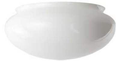
SHB300 Ceiling Bowl 135H 300Max Dia 255Gallery Ceiling galleries available.