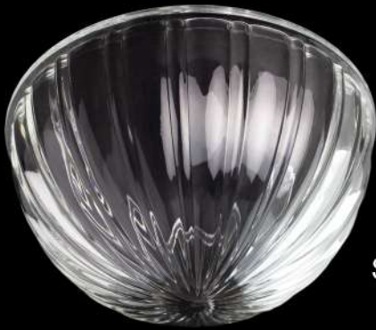
SHMELC Clear 150H 300Dia Available in clear or etched