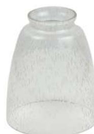
SHSEEDY Seedy Shade Seedy style glass 130H 110Dia 84mm Gallery neck (Not available etched)