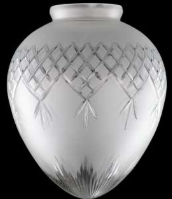
SHPS3 Low energy pineapple acorn 180H 160Dia 85Gallery (3¼")