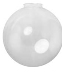
SHGC250 250H 250Dia 111Gallery (4¼")