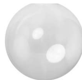
SHG300NN 300Max Dia No Gallery Neck 80Hole

2 piece screw gallery available VASE92 Or plain vase cap VASE100