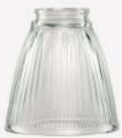
SH110C 115H 110Dia 50Gallery (2")