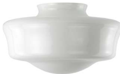
SHSCH School shade 200H 353Max Dia 150Gallery Plain + Decorative galleries available. Brass, Antique, Chrome