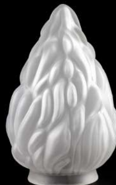
SHF3 Medium Flambeau 247H 160Dia 111Gallery