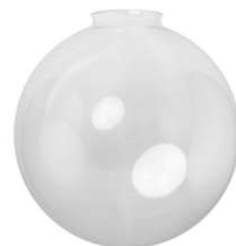
SHGC300 300H 300Dia 111Gallery (4¼")