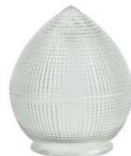
SHPA2 Cross reeded acorn shade 120Dia 135H 85mm gallery 0.45kg