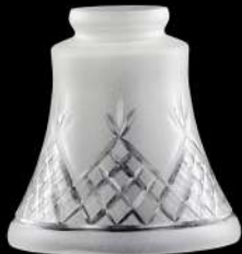
SHPF2 Pineapple fluted shade 130H 133Dia Gallery: Special, must be minimum 64mm (2¼").

STORM shades fit over BC lamp holder. Request a washer if not using our metalwork