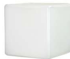
SHSQ120 Square Opal Shade 120x120x120 No Gallery Neck 53Hole