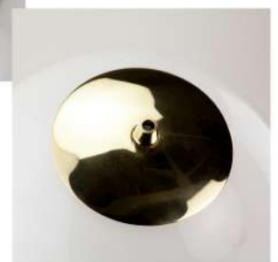
two piece solid neckless