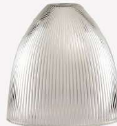
SH270C 285H 270Dia 3,35kg 41Internal Hole