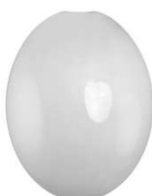
SHBLBE Etched Glass 355H 250Dia 92Hole

2 piece screw gallery available VASE92 Or plain vase cap VASE100