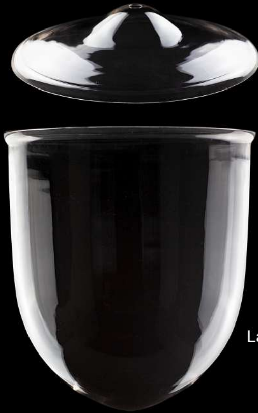
SHLID3 90H 400Dia

Mouth-blown glass, some with intricate hand-cut work