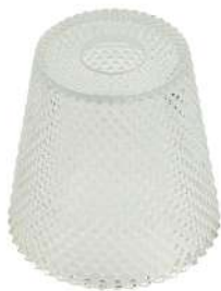
SHCRONE2 Diamond cross reeded shade 124Dia 125H state B22 or E67 Hole required