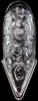
SHA2 H 180 W 180 Proj 220