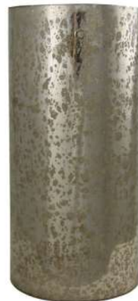
SHDM3 Large Cylinder With 3 holes for spider. 130Dia 280H