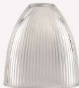
SH130C 140H 130Dia 29Internal Hole