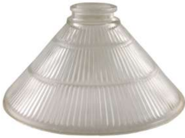
SH254C/ SH254E Coolie 120H / 254Dia Brass 64Gallery (2¼")