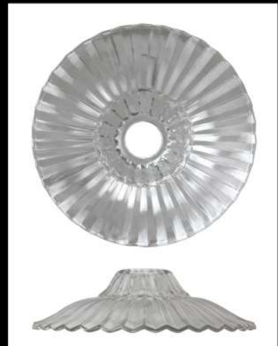
SHBLUME 70H 280Dia