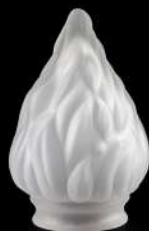
SHF2 Small Flambeau 182H 128Dia 85Gallery