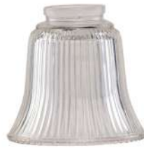
SH122C/ SH122E Teardrop Shade 115H 122Dia 64Gallery (2¼")