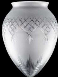
SHPS2 Small pineapple acorn 165H 123Dia 85Gallery (3¼")