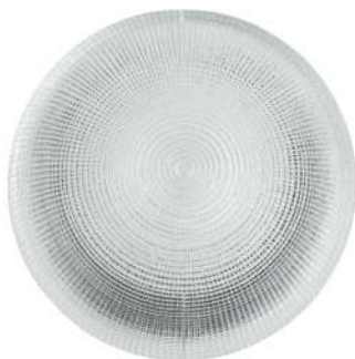
SHPG355C Cross reeded prismatic half dome 355Dia 3kg includes 7mm lip all round 140mmDeep