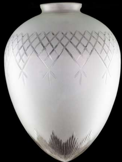
SHPS6 Large pineapple acorn 410H 295Dia 2,5kg Gallery: Special 111mm with Safety butterfly release mechanism. New decorative gallery also available.