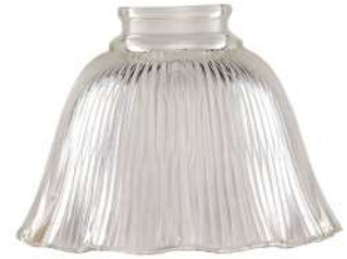
SH165C/ SH122E Small Frill Shade 110H 150Dia 64Gallery (2¼")