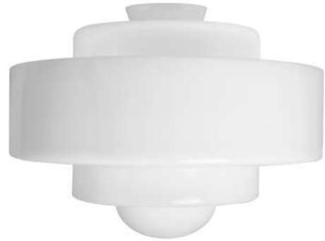
SHSD3 215H 300Dia 111Gallery (4¼")