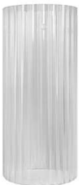
SHCR9 Clear reeded glass cylinder 250H 110Dia