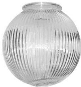
SHPG305C Large reeded globe 305H 305Dia 111Gallery (4¼")