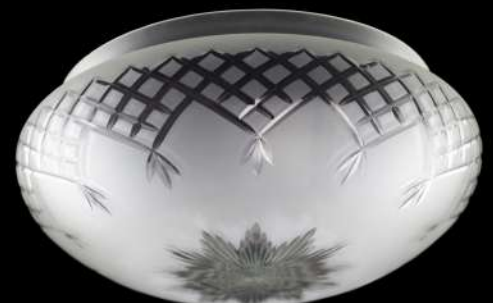
SHPB3 125H 300Dia 255Gallery