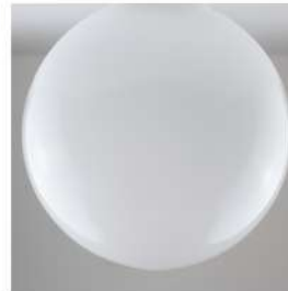
SHG250NN 250Max Dia No Gallery Neck 80Hole 2 piece screw gallery VASE92 Or plain vase cap VASE100