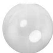
SHGC200NN 200Max Dia No Gallery Neck 80Hole