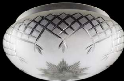
SHPB2 115H 250Dia 205Gallery