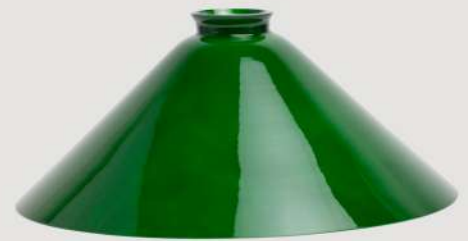
SHCG Green painted coolie 290dia 120H 65Gallery (2¼")