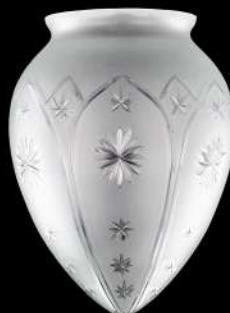
SHST2 Small star acorn 165H 123Dia 85Gallery (3¼")