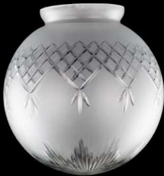
SHPG2 Small pineapple globe 160H 155Dia 85Gallery (3¼") Also available SHPG3 (260H/250D/111Galery)

Hand blown and brilliant cut shades. All are etched with clear brilliant cut pattern except SHPC2.