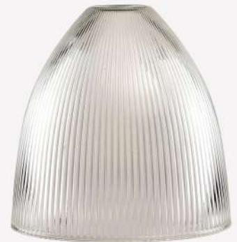
SH350C 353H 350Dia 6,15kg 41Internal Hole