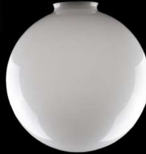
SHG305 305Max Dia 111Gallery (4¼")