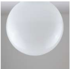
SHG150NN 150Max Dia No Gallery Neck 42Hole 2 piece screw gallery VASE93 Or plain vase cap VASE60