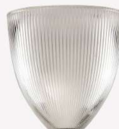
SH270CH 270W 135P With 2x6mm Dia side holes