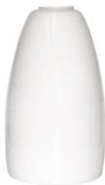
SHNERO Nero shade 185H 120Dia No Gallery Neck 30Hole