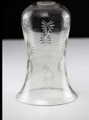
SHPST3 Clear star storm shade 137Dia - Top 215H 110Dia - Bottom 34mm Internal Hole

STORM shades fit over BC lamp holder. Request a washer if not using our metalwork