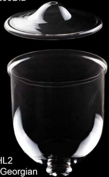
SHL2 Medium Georgian 270H 226Dia