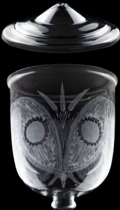
SHFL3 Large Fern 360H 284Dia