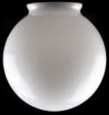
SHG150 150Max Dia 85Gallery (3¼")