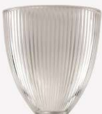
SH200CH 200W 100P With 2x6mm Dia side holes