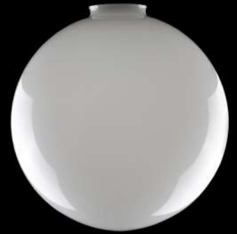
SHG350 350Max Dia 111Gallery (4¼")