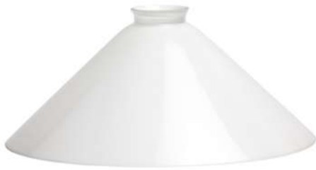
SHCW White opal coolie 290dia 120H 65Gallery (2¼")