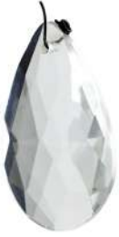
SHC8 Large Clear Almond 80H 50W