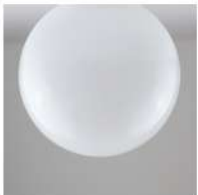
SHG100NN 100Max Dia No Gallery Neck for spring arm fastening 30Hole Plain vase cap VASE60