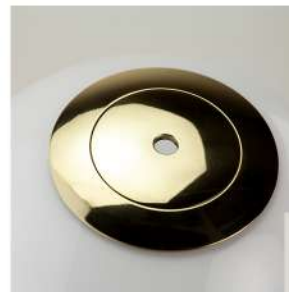
solid neckless screw fitting

We have caps for spring fastened neckless globes and cast brass two piece screw caps for neckless that hold horizontal mounted globes perfectly