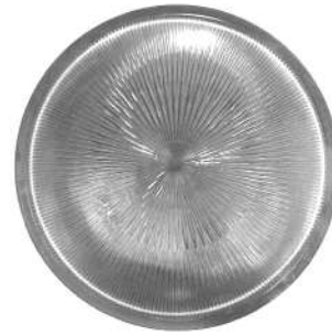
SH800C 119H 800Dia 8,5kg