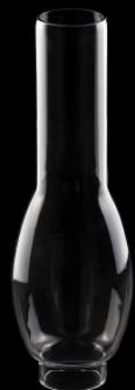
SHCH Oil Chimney 270H 90MaxDia 50Necksize