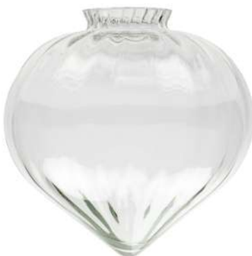
SHSAFI/ SHSAFIE Safi Shade 240H 240Dia 85mm Gallery