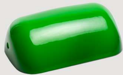
SHBK Green painted bankers lamp 75H 224W