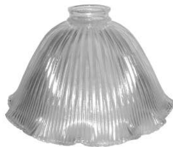
SH225C/ SH225E Medium Frill Shade 140H 225Dia 64Gallery (2¼")