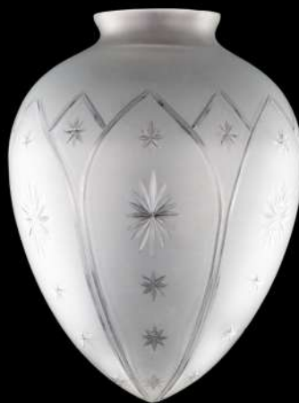
SHST4 Medium star acorn 250H 190Dia 85Gallery (3¼")