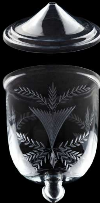
SHFL2 Small Fern 270H 202Dia