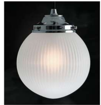
Shown with etched finish