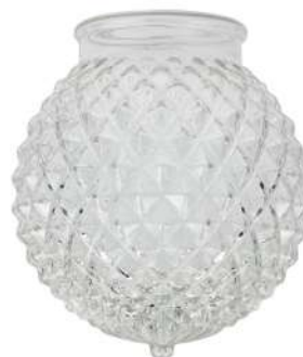
SHMACE Mace Shade Pyramid style glass 160H 140Dia 85mm Gallery neck