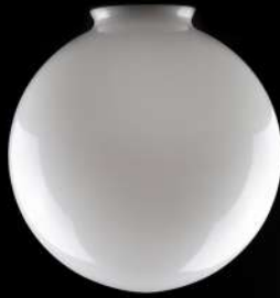
SHG250 250Max Dia 111Gallery (4¼")