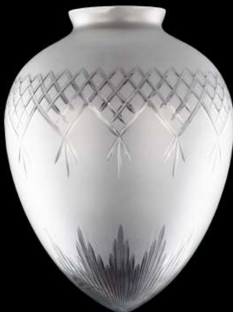
SHPS4 Medium pineapple acorn 250H 190Dia 85Gallery (3¼")