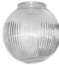
SHPG200C Medium reeded globe 205H 203Dia 111Gallery (4¼")