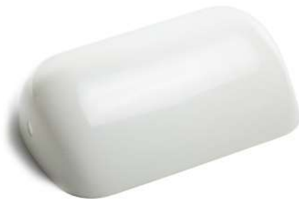
SHBKW White bankers lamp 75H 224W