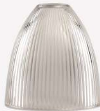
SH200C 210H 200Dia 1,8kg 41Internal Hole