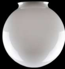
SHG205 205Max Dia 111Gallery (4¼")