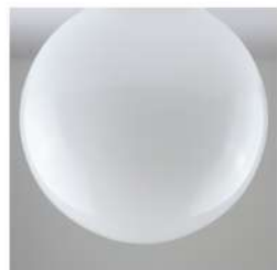
SHG205NN 205Max Dia No Gallery Neck 80Hole 2 piece screw gallery VASE92 Or plain vase cap VASE100