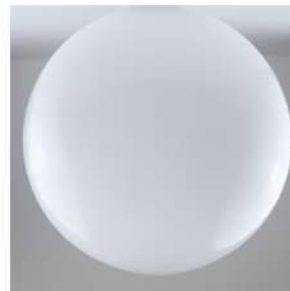
SHG305NN 305Max Dia No Gallery Neck 80Hole 2 piece screw gallery VASE92 Or plain vase cap VASE100