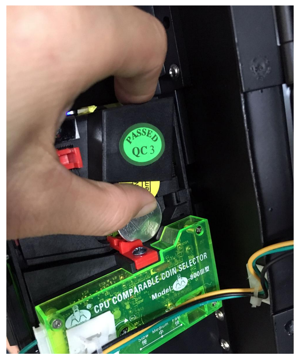
1) If put $1 coin in this place, then the coin acceptor can accept $1 coin.

(6) How to program the coin mechanism to use our local coins? Answer: Please see below picture instruction: