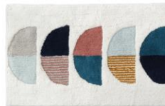
half moons bath mat $40, westelm.com