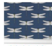
harlequin demoiselle wallpaper $198 per roll, decoratorsbest.com