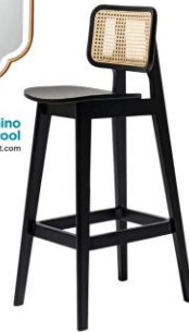
domino counter stool $595, industrywest.com