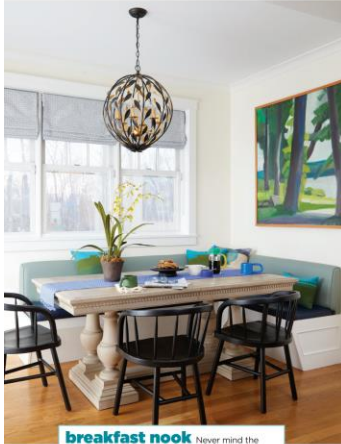
breakfast nook Never mind the name: Amy and the kids eat breakfast at the kitchen island and dinner right here. The antiqued gray oak table is from Rik, and the captain’s chairs are from Pottery Barn. As a nod to the surrounding nature preserve, Sally hung an oil painting by local artist Dave Gloman. The chandelier, from Lumens, looks like leaves in a fairy-tale forest.

“There’s no formal dining room in the house—and we don’t miss it at all.” —Amy