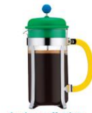
bodum caffettiera french press $25, store.moma.org