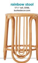
rainbow stool 17 1/2" tall, $198, burkedecor.com