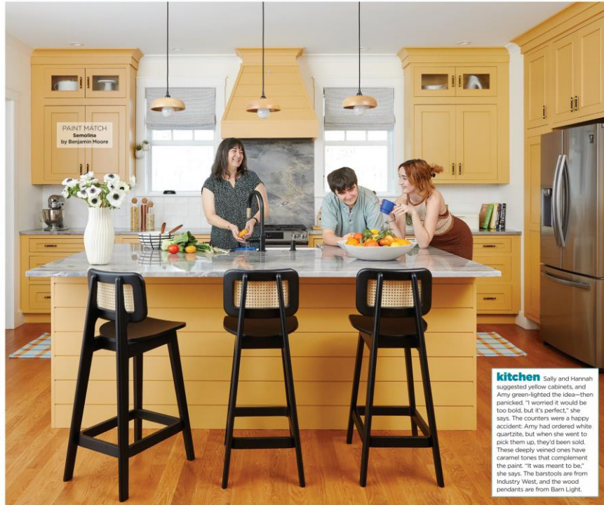
PAINT MATCH Seminole by Benjamin Moore