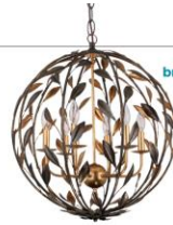
broche english chandelier 21" dia., $900, lempex.com