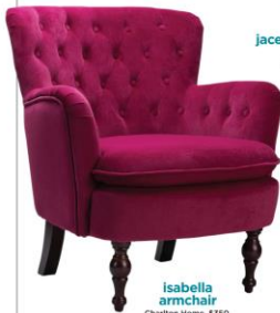
isabella armchair Charlton Home, $350, wayfair.com