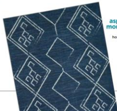
aspen tribal moroccan rug from $76, homedepot.com