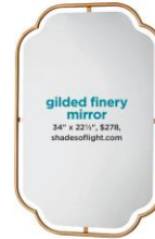
gilded finery mirror 34" x 22 1/2", $278, shadesoflight.com