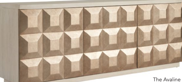
Credenza from Universal Furniture. 101 S. Hamilton St. universalfurniture.com

Artful Gold with White collection from Pacific Connections. SAMS G-6013 pacificconnectionsusa.com