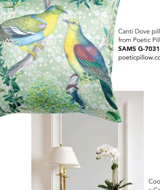
Canti Dove pillow from Poetic Pillow. poeticpillow.com