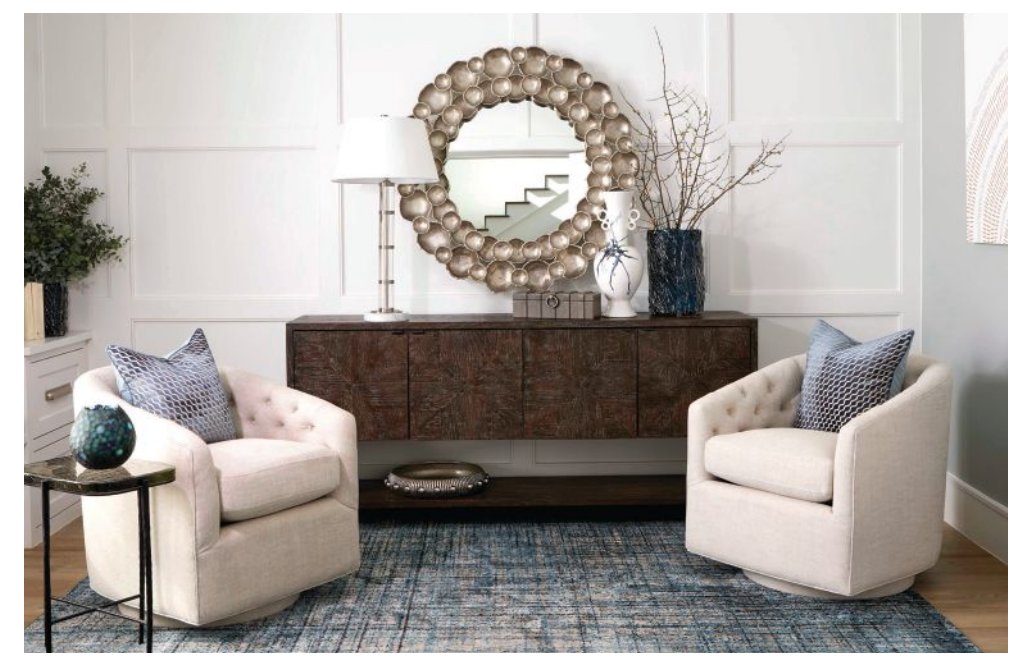
At Cyan Design, the team hones in on design relationships that have developed organically when seeking partnerships (above). Partnerships have resulted in a collection of accent pieces for Howard Elliott, such as this golden-accented mirror (left).

"For me, it's a financial choice," she says. "I'm not ashamed to say that, and I work really hard to make it happen! I let my partners know I'm in it for the money up front, and usually, they like to hear it. If I'm making money, it means they are making money!"