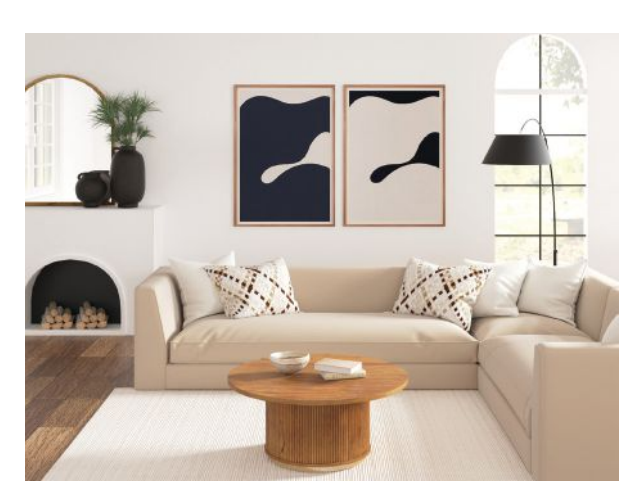
Hand-woven New Zealand Wool Rug from LR Home. IHFC - D531 LRHome.us