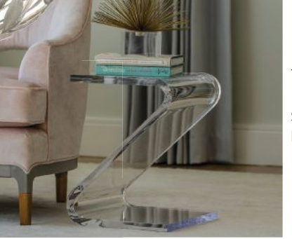
The Z Table from Boda Acrylic. SAMS M-6039 bodaacrylic.com