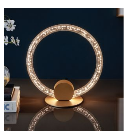
LED accent table lamp from Lite Source. IHFC - H437 lite-source.com