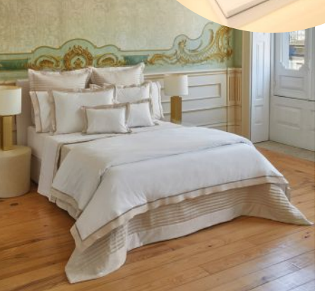
The Escada bedding set from Bovi Graccioza. IHFC - IH504 bovigraccioza.com