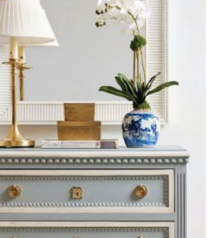
Cooper Classics x Caitlin Wilson Fluted Wall Mirror. IHFC - D519 cooperclassics.com

Artful Gold with White collection from Pacific Connections. SAMS G-6013 pacificconnectionsusa.com