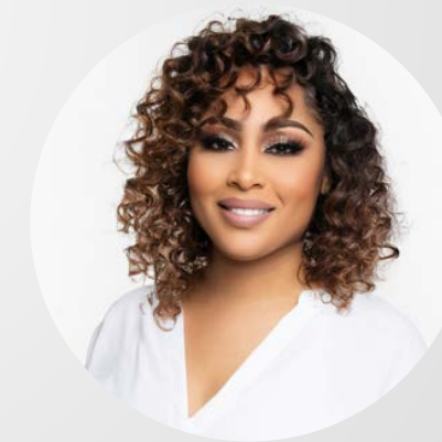
KYSAN DIRECTOR OF MARKETING AND CUSTOMER ENGAGEMENT