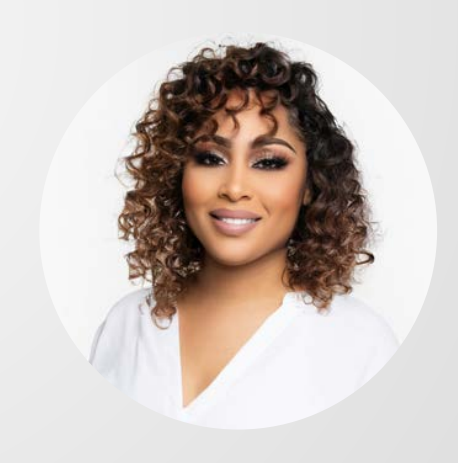
KYSAN DIRECTOR OF MARKETING AND CUSTOMER ENGAGEMENT