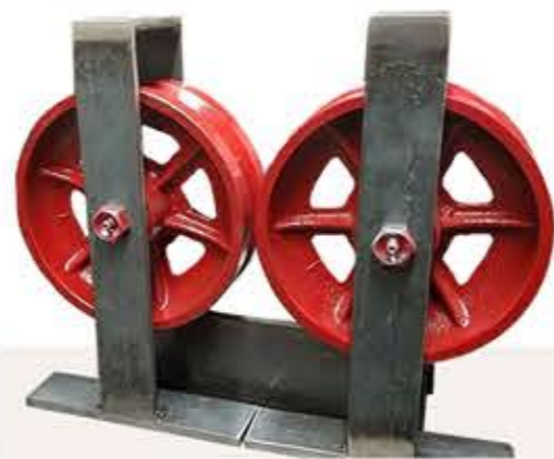
Custom Fabricated Sliding Hardware for Industrial Applications