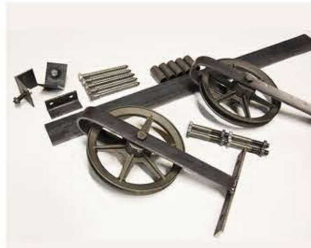
Top Mount Classic Vinatage Sliding Hardware