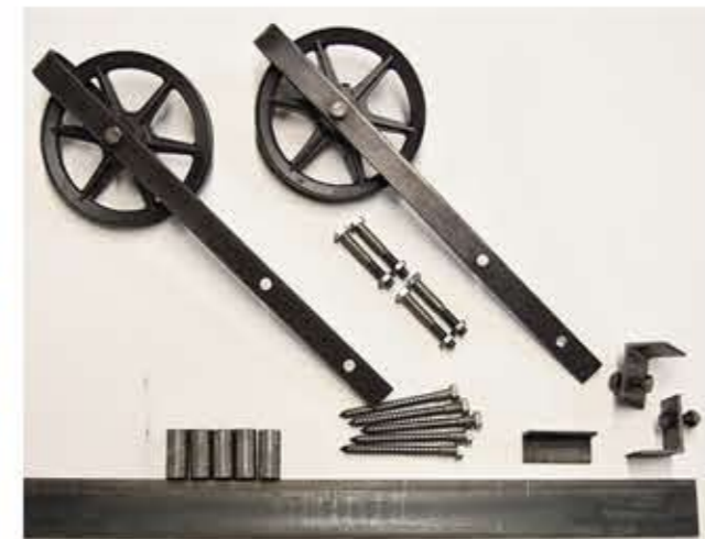
Classic Vintage Sliding Hardware