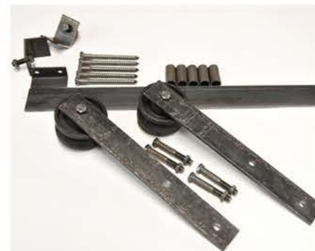
Caster Series Sliding Hardware