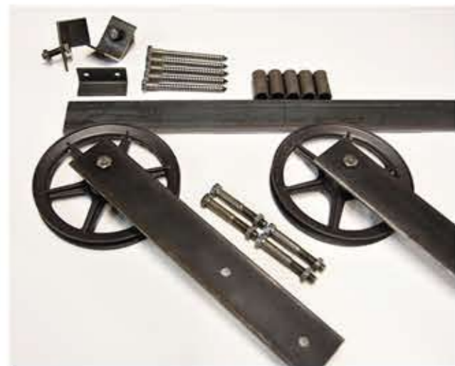
Vinatge Flat Sliding Hardware