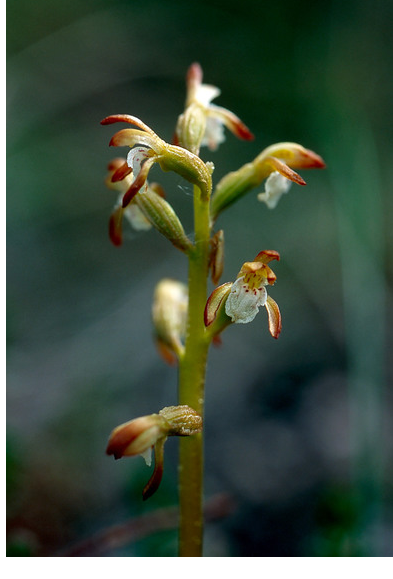
Northern Coral Root