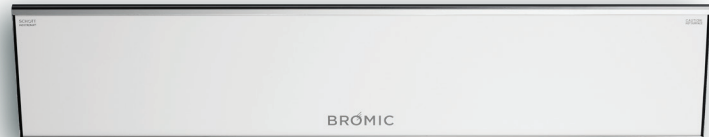
2400W & 3400W WHITE

NEED HELP TO SELECT THE RIGHT HEATER FOR YOUR HOME? Ask your sales specialist in store about the Bromic Complimentary Design Service