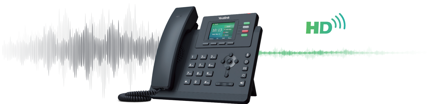
Smart Noise Filtering

The Yealink T3 series provides distraction-free communications with industry leading Smart Noise Filtering Technology, which delivers excellent sound quality without extraneous noises and allows fluent conversations.