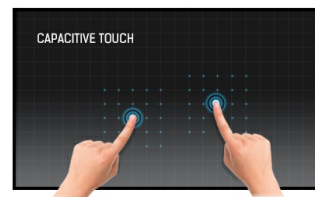
Touch technology - Capacitive

IPS displays are best known for wide viewing angles and natural, highly accurate colours. They are especially suited for colour-critical applications.