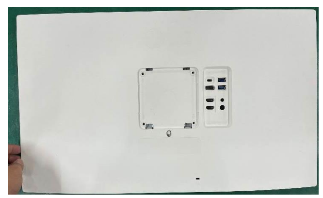
Re-overturn the set and disaaemble screw 4EA and disassemble the PCB