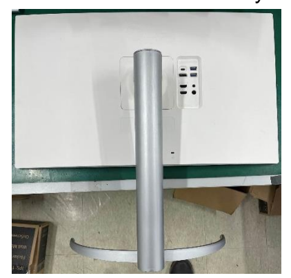
Unscrew the stand base by using coin