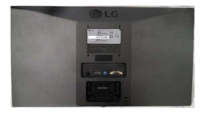
Re-overturn the set and disaaemble screw 4EA and disassemble the PCB