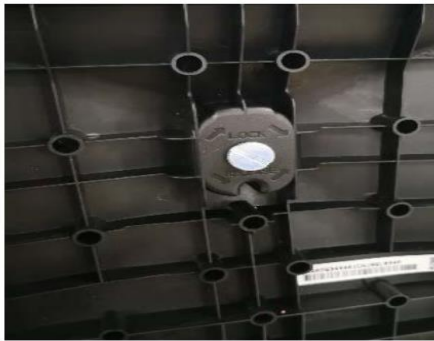
Push button and lift the stand body and remove the screw(4EA)