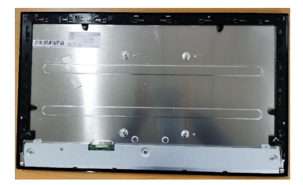
Re-overturn the set and disaaemble screw 4EA and disassemble the PCB