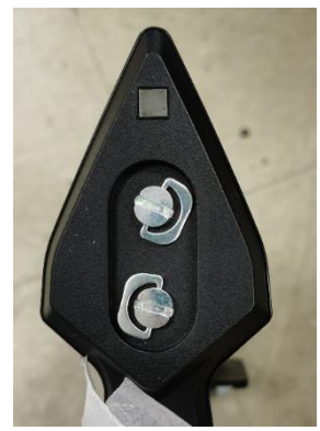
Push button and lift the stand body and remove the screw(4EA)