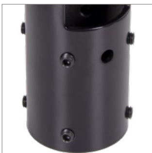
Grub screws allow micro-adjustment of the pole angle once mounted