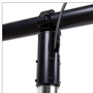
Integrated cable management for a neat and tidy installation