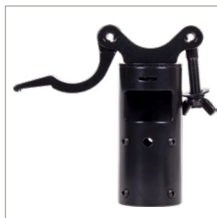
Wing-nut fixing allows quick release of the clamp from the pole