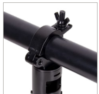
Fits truss systems from 42mm up to 50mm