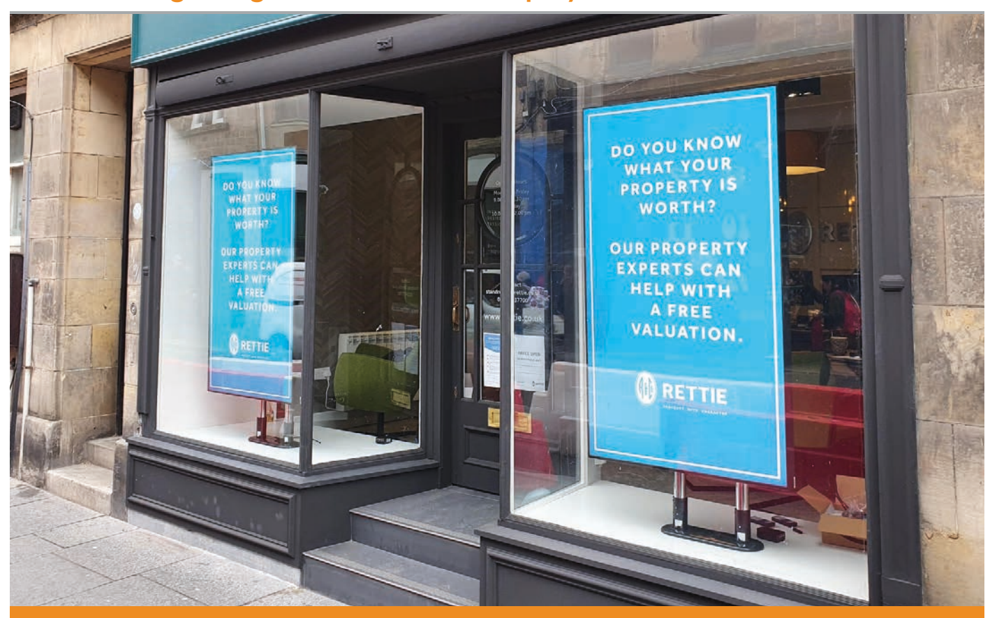
Designed for outward-facing window displays in direct sunlight