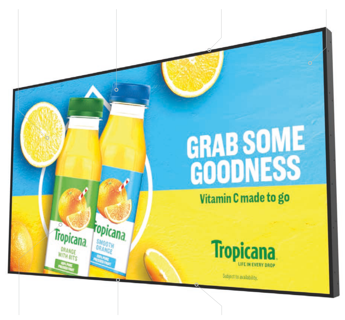
SUPER HIGH CONTRAST RATIO