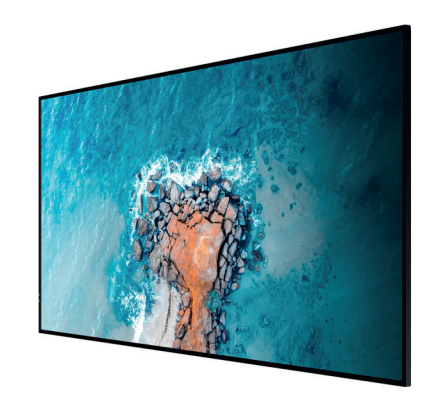
Specification subject to change | Oct 2023