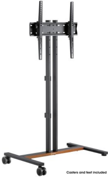
Casters and feet included