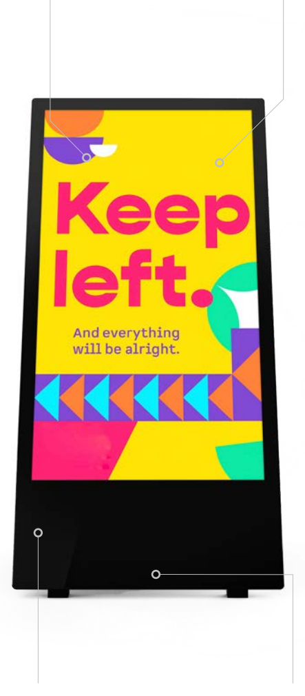
TEMPERATURE CONTROL SYSTEM