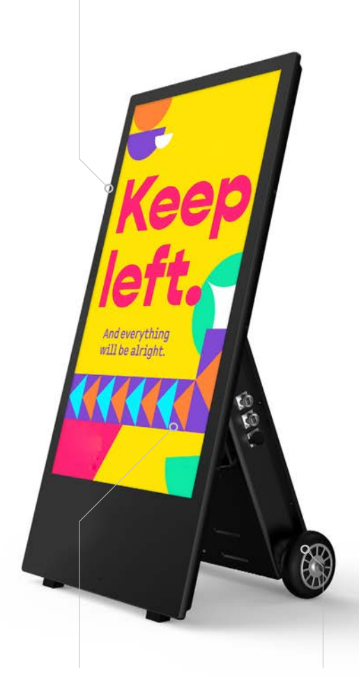
ULTRA RESISTANT TO BLACKENING DEFECT*