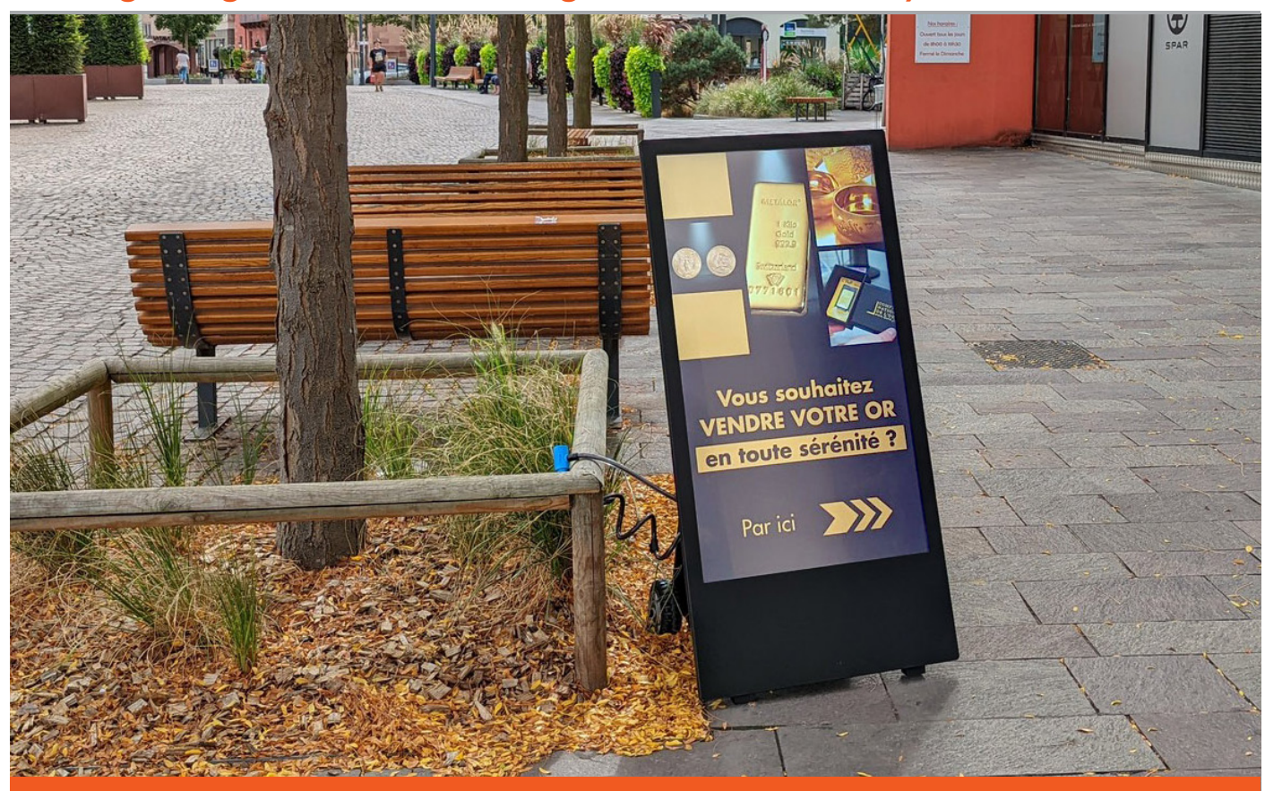
Sunlight readable and fully portable solution for any space; display content all day and night from a single charge.