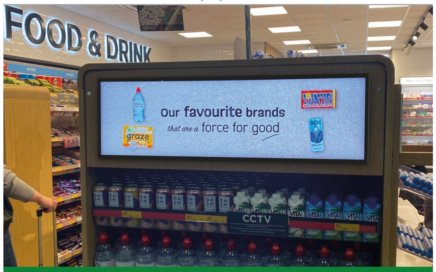
Perfect as a banner-style endcap display in retail stores and supermarkets